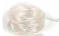
Hose By The Foot Part# HOSE-FT