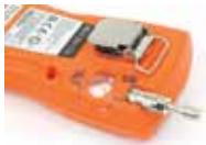
MGC Pump Quick Disconnect* Part# MGC-PUMP-QD