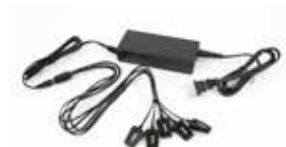
MGC Multi Charger Part# MGC-CHRG-MULTI