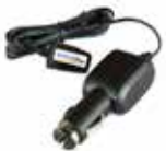
MGC Vehicle Charger Part# MGC-V-CHARGER1