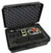
Confined Space Kit Part# CSK-XP *XP Included*