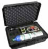
Confined Space Kit w/ Gas Part# CSK-XP-GAS *XP Included*