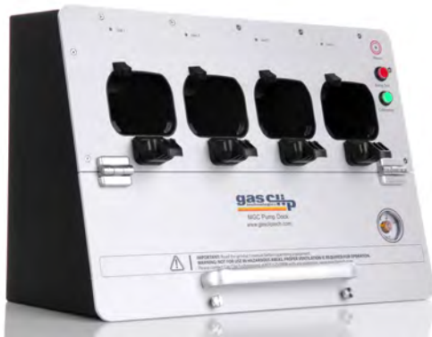
MGC Pump Wall Mount Dock