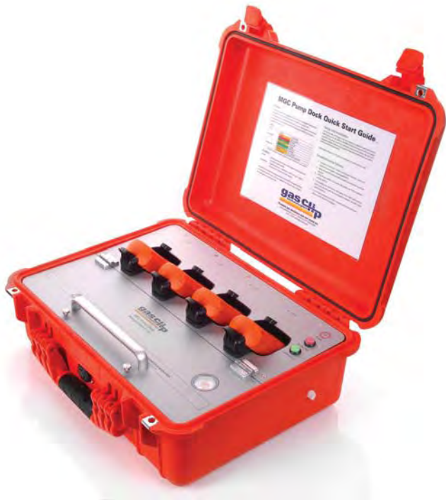
MGC Pump Dock