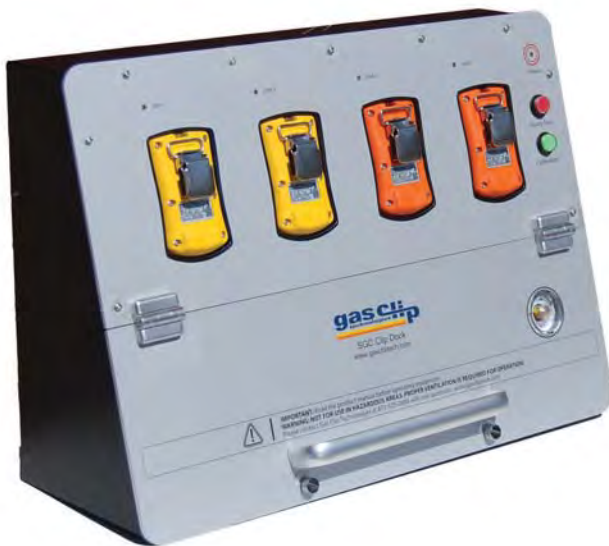
SGC Wall Mount Dock