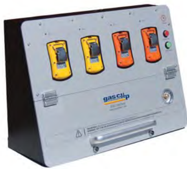
SGC Wall Mount Dock