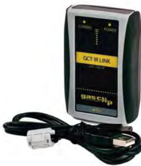
GCT IR Link