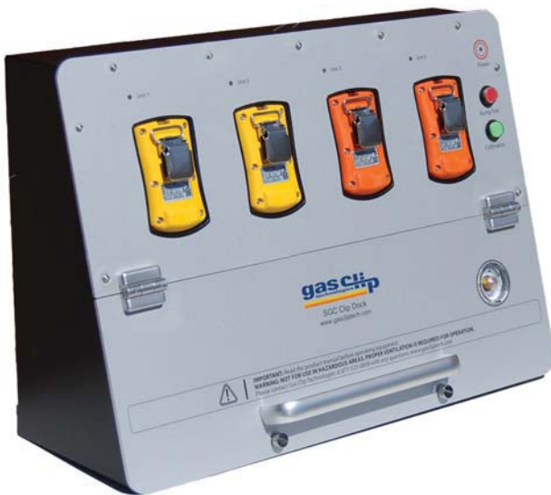
SGC Wall Mount Dock