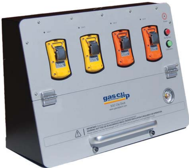
SGC Wall Mount Dock